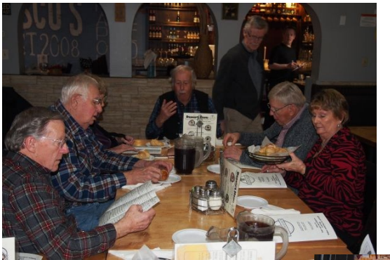
28 members and 2 guests enjoyed the fine cuisine at Francesco's. This is a favorite dining site for our group.