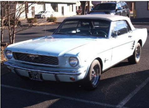
Butch & Peggy Beverly crossed the windy mountain in their Mustang convertible.