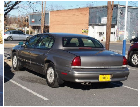
Robbie Gray brought out the 1994 Chrysler LHS with a VMCCA License plate?