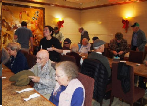
We brought in an extra table to seat the 31 members present.