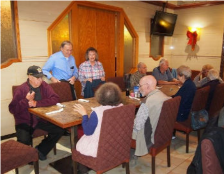
Our group gathered at the usual side room at Ming Garden.