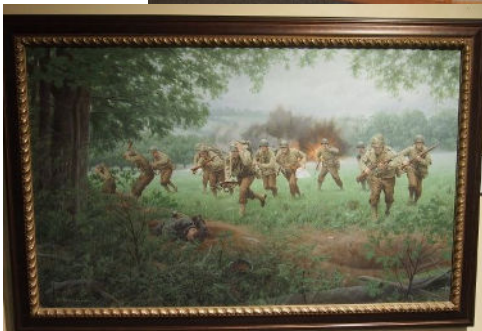
Visitors could spend hours at the museum, reading the information that is included with each display.