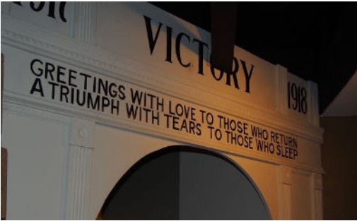
Samples of the displays at the museum.