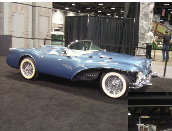
The 1953 Buick Wildcat II was part of our display. This GM concept car is part of the Sloan Museum collection in Flint MI.