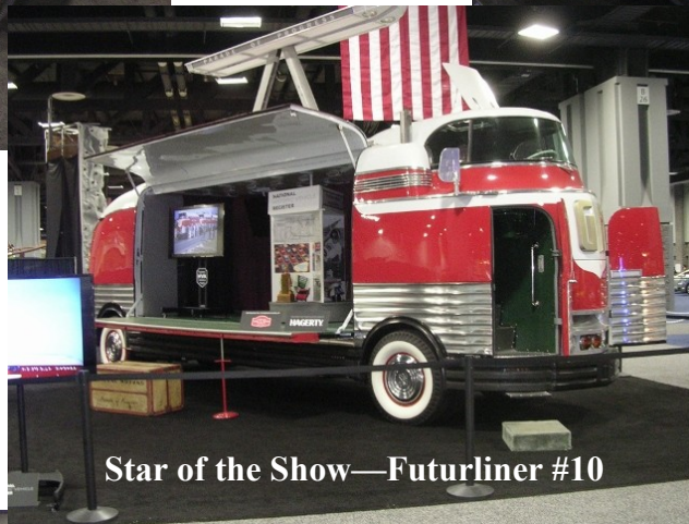
Star of the Show—Futurliner #10