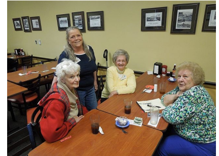
The 65th Decorating Committee