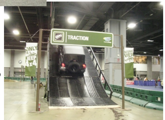
Jeep was offering rides over an obstacle course set up inside the show complex.

APRIL MEETING: Saturday, April 18, 4 PM, 65th Anniversary Catered Dinner & Entertainment - Rimels' Barn, 2165 Churchville Ave., Staunton.