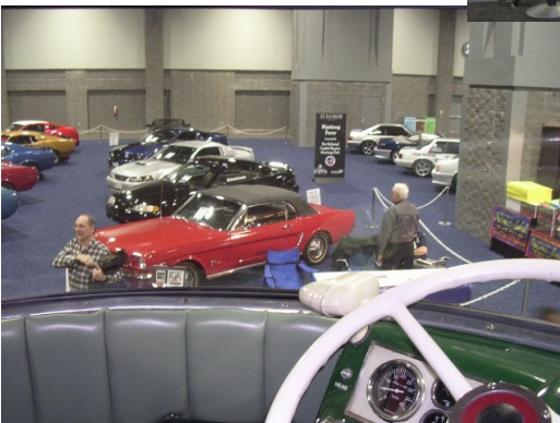
The local Mustang Club had a large display of their cars.