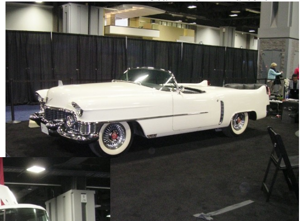
This 1954 Cadillac 2-seater concept was also featured in the display. It is owned by a private collection