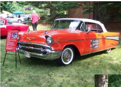
1957 Chevrolet Convertible formerly owned by rock singer Alice Cooper.