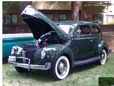
Owen Harner's 1940 Ford