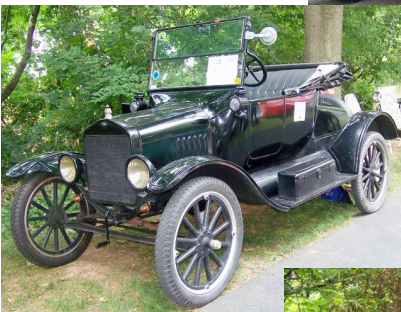
Billy Melton's 1923 Ford Model "T"