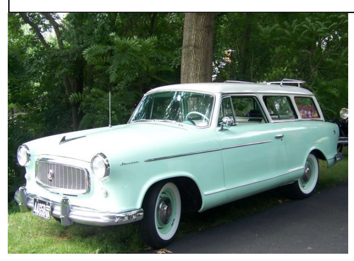
When did you last see a 1960 Rambler wagon? Al Morkunas brought this great example.