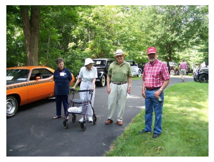
BP residents were out in force and we enjoyed their memories of cars like ours "back in the day".

On Saturday, July 9. 2011 the W/S Region put on our annual car display at Baldwin Park. The weather was spectacular and 31 cars were on display by members and a couple of guests.