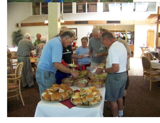
Baldwin Park served up a delicious lunch buffet