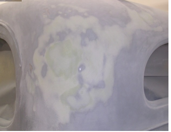
Here is an example of what happens when you sand over a high spot. Bare metal shows through and it's time to hammer or grind down the spot, spray more epoxy, followed by primer surfacer