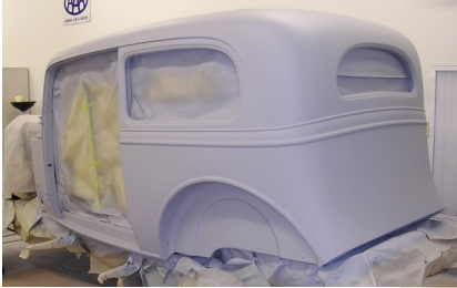
Multiple coats of primer surface were then applied with sanding between coats to assure a smooth surface.