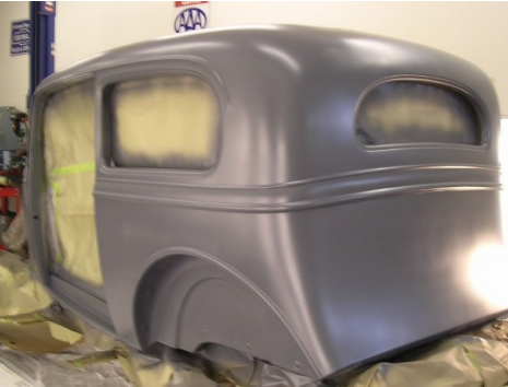
Once the primer was sanded smooth, a coat of sealer was applied, and followed immediately by finish paint