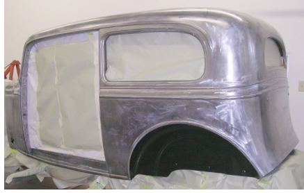
Next I used rotary cleaning discs to get to bare metal, followed by sanding to remove any deep scratches

After etching the bare metal, double coats of epoxy primer were sprayed to provide a base for further body work.