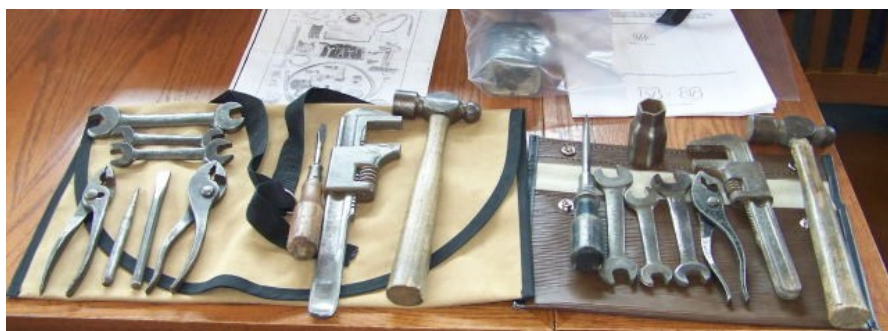
Stu Allen's tool kits for '17 Buick and '34 Chevy