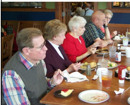
Wood Grill food was great as usual!