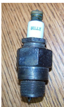
Bill Melton's "BILLY" spark plug