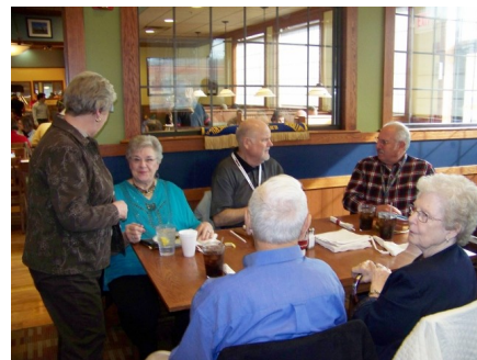
Members gather at the Wood Grill