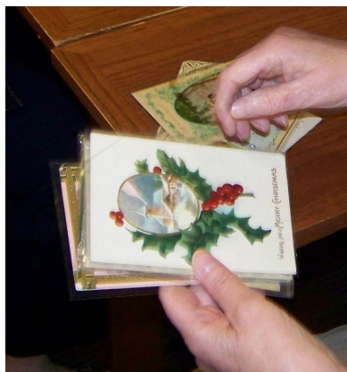
Jim Gregory's card collection—102 years old!