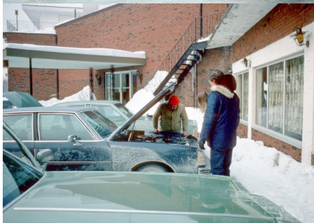
Test cars being prepped at the motel

The test cars typically performed very well, starting and driving easily at temperatures between -20° and -30° F. Occasionally we would have a battery that just wouldn't crank the engine over and we would swap it for a freshly charged unit from the Test Center. Making carburetor changes outdoors at those temperatures was a challenge but there were heated bays available if complications arose. Once we had obtained sufficient test data over several days, we packed up the cars and headed south to warmer climes.