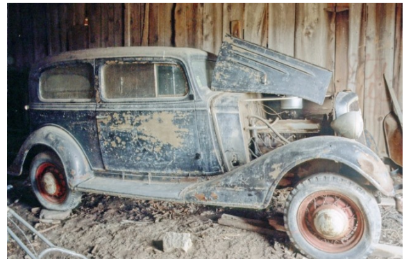
In Grandpa's Barn—1978

Newsletter editor has his '34 Chevy running after 34 years. (It's not quite done yet!)