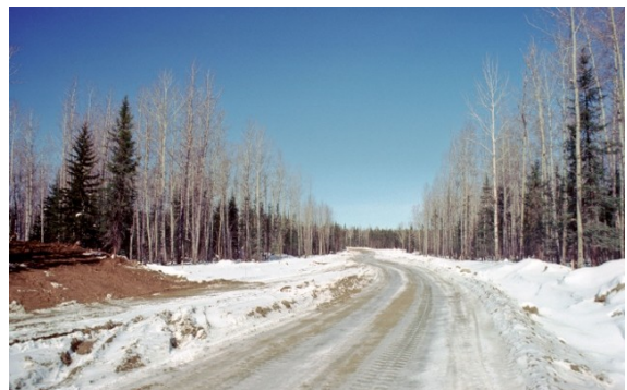
Typical snow/gravel highway in Northern Ontario

Rochester, with its reputation for some extreme temperatures, gave us a good cross-section of test conditions but when we wanted to do repetitive testing at extremely cold temperatures, we travelled to the GM Cold Weather Test Facility in Kapuskasing Ontario. "Kap" as it was nicknamed, is 525 miles north of Toronto (300 miles north of North Bay) so to say it is a remote area is an understatement.