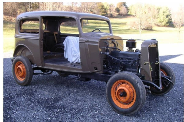
In Stu's driveway after maiden voyage—Dec. 2012 Watch this space for future progress!

NEXT MEETING: : Sunday, February 17, 2:00 PM, W-S Region Meeting, Red Lobster Restaurant, Staunton Mall, Program TBA