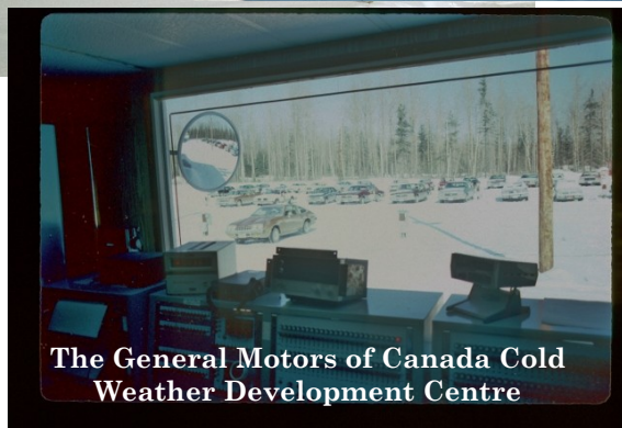
The General Motors of Canada Cold Weather Development Centre

When standing in your motel room your head was at 85° and your feet were at 30° so on average the room was very comfortable. Actually, Kap was a nice place to visit (but I wouldn't want to live there)!