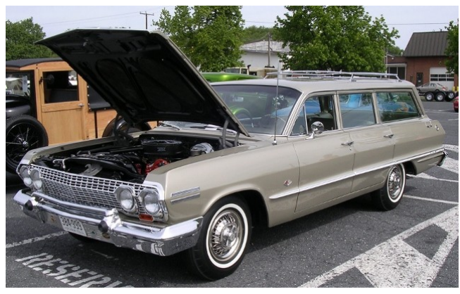
1963 Chevrolet Impala Wagon-Ken Farley