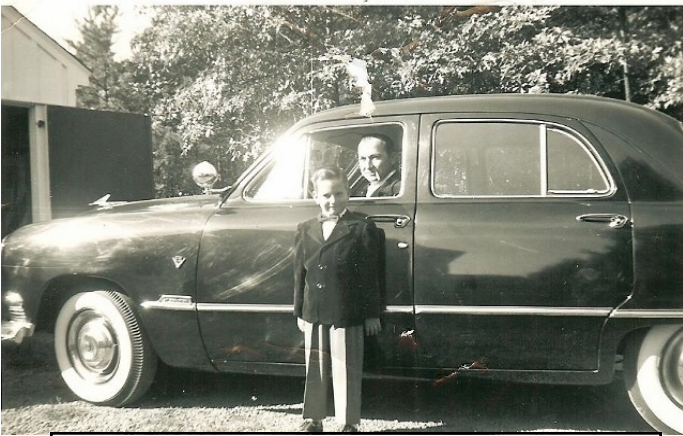
This picture was taken when I was 4 or 5 and Dad driving

On Feb. 10, 1951, Dad took delivery of a Ford Custom Deluxe 4-door sedan. For the price of $2157.40 he got radio, heater, turn signals, Fordomatic, white wall tires and undercoat.