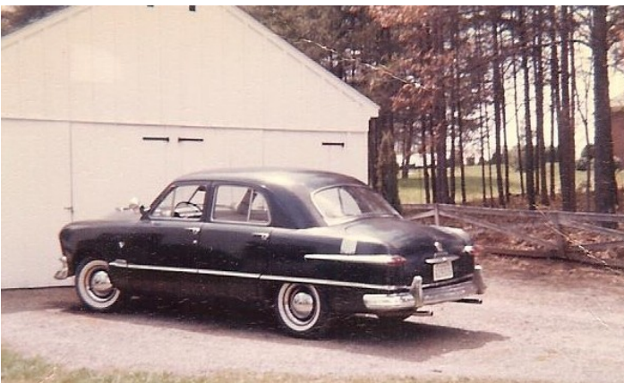
This is when I owned the car for the first time. I took the picture from the back to show the dual exhaust I had just put on. I ordered the kit from J.C. Whitney.

Then in 1964 Dad bought a '62 Thunderbird and I bought the '51 Ford for $150. Although I had a part-time job, I didn't have money for insurance so the car sat in the driveway from October to January. During that time I waxed it enough that I waxed the paint on the hood down to the primer, but I had shiny primer!