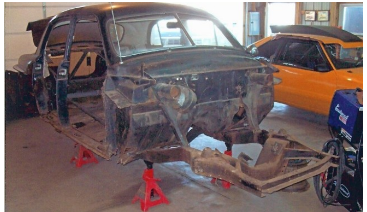
This is a picture is of the car today. We are making progress putting in the floor.

We moved to Waynesboro in 1983 and after about 3 years I thought I would do some floorboard work on it. After removing the interior and finding not only the floorboards bad but also inner and outer rocker panels, floor supports, door posts and other stuff I felt I was in over my head. I took it to a restoration shop and told them I was in no hurry to get it done. About twenty years later it still hadn't been worked on but it had been stored inside. My son and I decided it would be a good father/son project. (Of course Dad is the banker - Some things never change!)