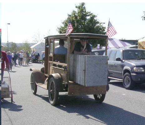
How do you haul a telephone booth? Use your Model T!