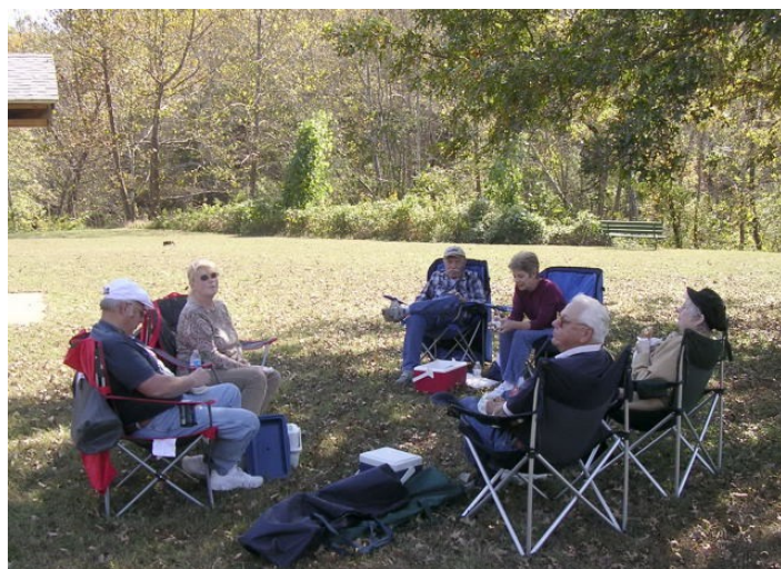
On a beautiful fall day—some chose the sunshine—others enjoyed the shade