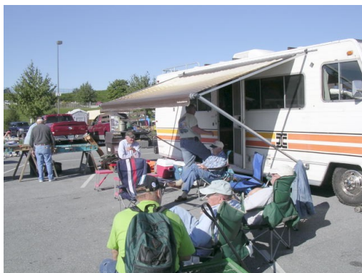
Jim Gregory & friends' spot in the Chocolate Field