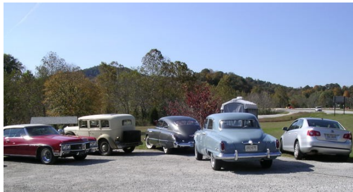
Members' cars at the lunch stop at Woods Mill wayside—Route 29