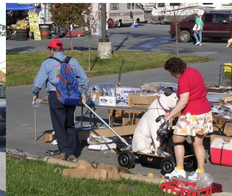
Remember the RCA dog who listened to His Master's Voice ? This couple bought him at Hershey!