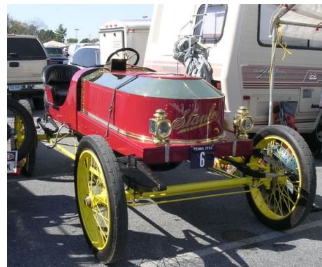
Stanley Steamer speedster in the swap meet