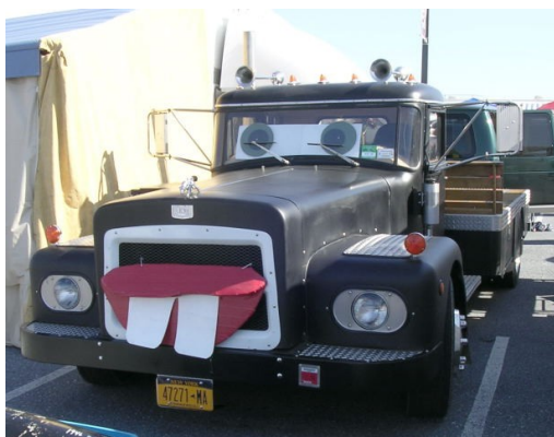
Cars celebrity Mater was spotted in the Green Field