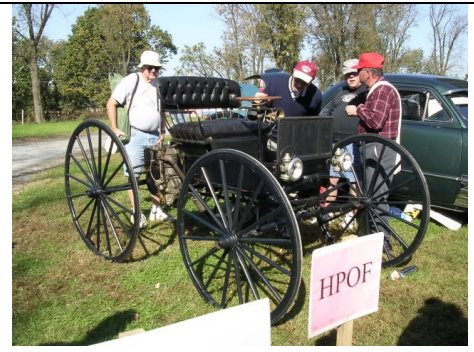
1907 Success gets an assist ————— 1-Cylinder power ————— Draws a crowd on the show field