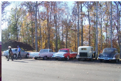
Our final stop was a tour of the Devils Backbone Brewery