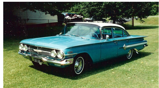
1960 Chevrolet Bel Air 4-Door