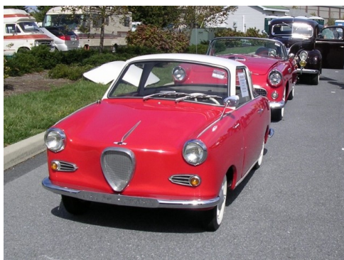
1969 GoGo Mobile—$25,900