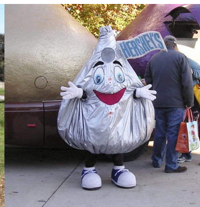
Lifesize Hershey Kiss