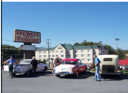
Our lunch and meeting were held at the Redwood Family Restaurant