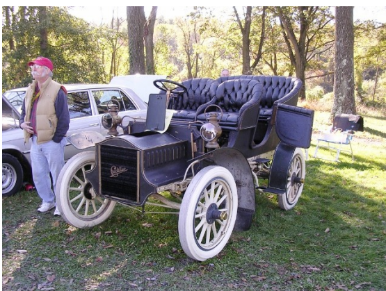
1905 Cadillac HPOF