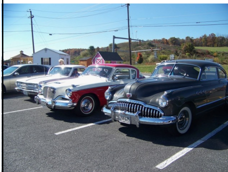
The W-S members gathered at the Staunton Mall