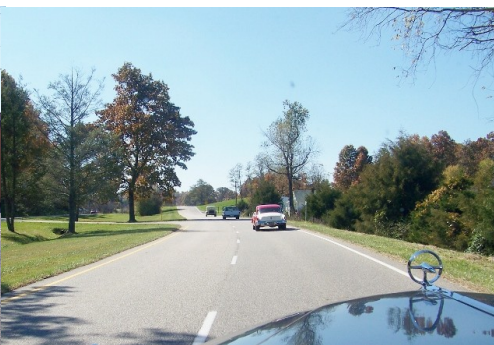
Route 11 provided great color as we headed to Lexington