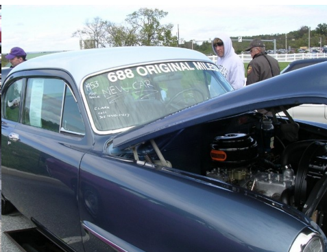
1953 Plymouth w/ 688 miles