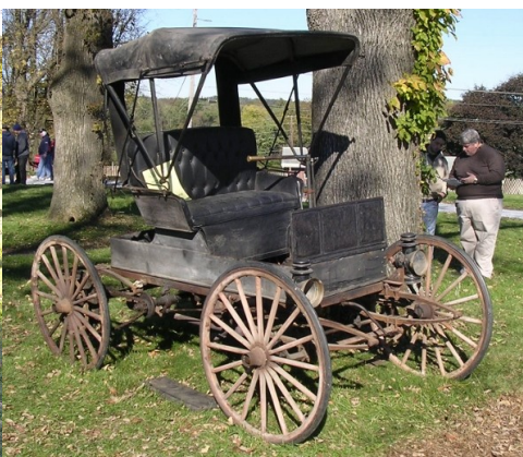
1908 Sears HPOF