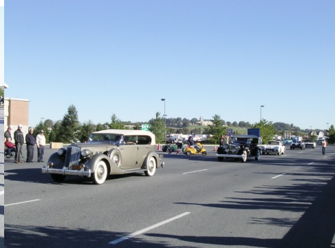
Saturday Morning—The cars enter the showfield