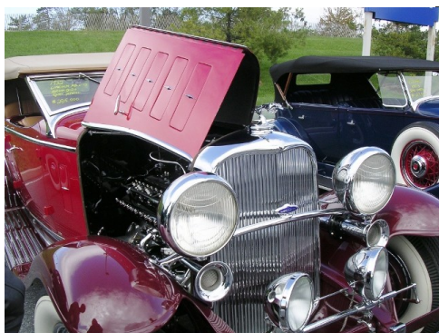
1932 Lincoln V-12—$285,000.