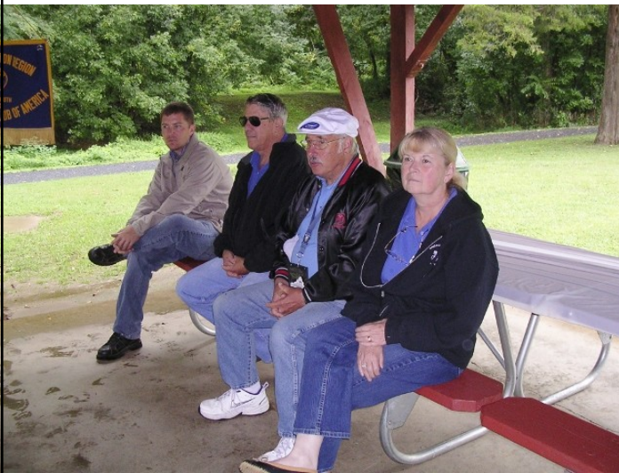
When do we eat?