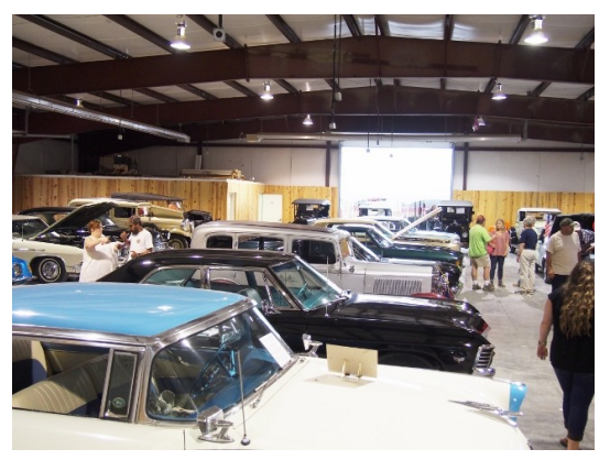
Spectator traffic was steady all during the show—much better than in 2016.

Cars built from 1924 through 1990 were on display.