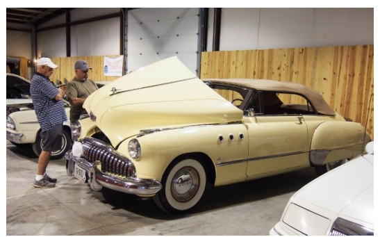
Jim Gregory shows a visitor the straight eight of his 1949 Buick Super Convertible.