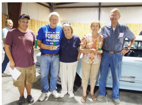
Our winners at the trophy presentation.