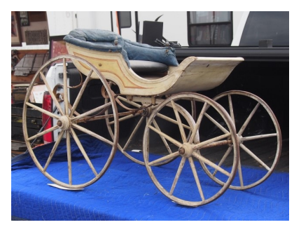
What is it?

NOVEMBER MEETING –Sunday, Nov. 19, 2 PM, <u>Meeting & Election of Officers</u>, Heritage on Main, 309 West Main Street, Waynesboro - <u>Annual Show & Tell Meeting</u>