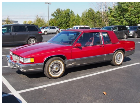
Jim & Mary Owen brought their newly acquired 1990 Cadillac Coupe de Ville with only 20,000 original miles.