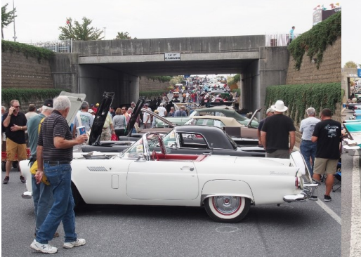
Lots of people and T-Birds in the Car Corral with Hershey prices.