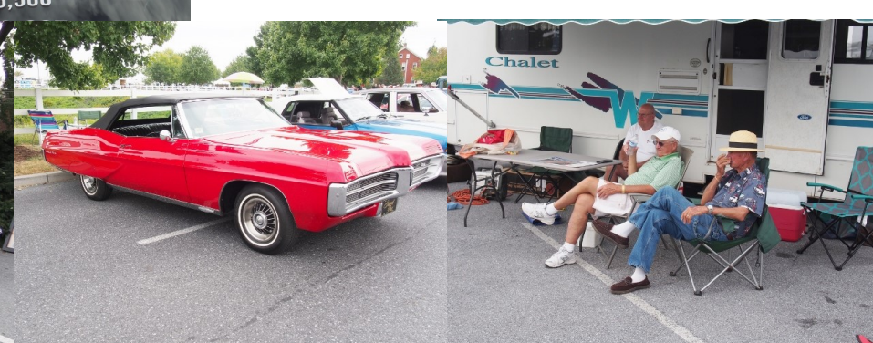
How about a red Pontiac Grand Prix?