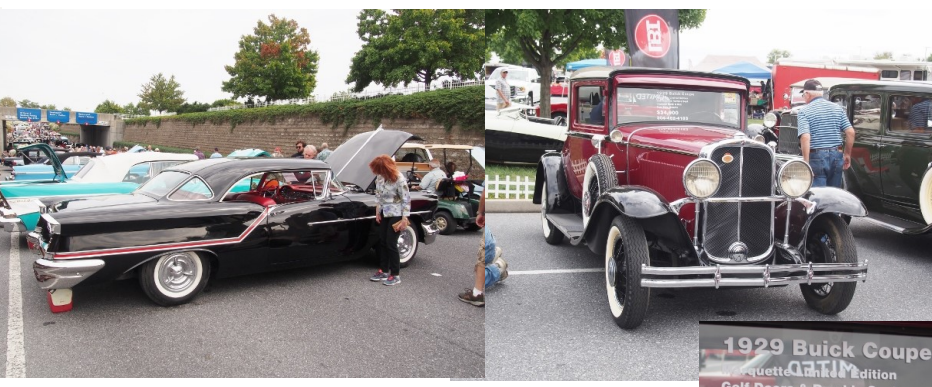
Nice '57 Olds. 88 J2 with tri-power listed at $34,500.