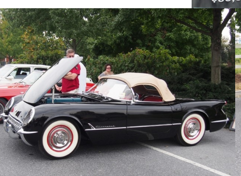
Nice '54 Corvette.