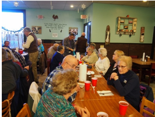
Members get settled in prior to enjoying the barbeque buffet.