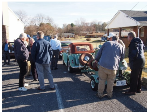
It was a great day to enjoy the sunshine and great cars. Not bad for February!