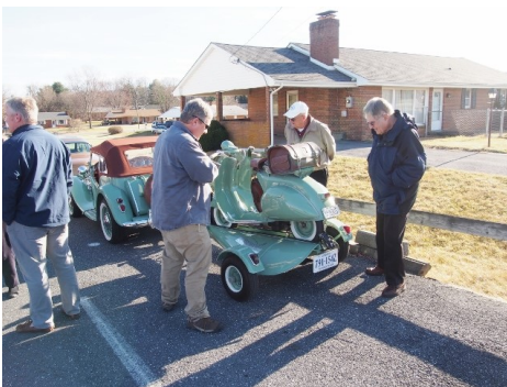
Members check out the Allstate scooter and trailer. Not something you see every day.