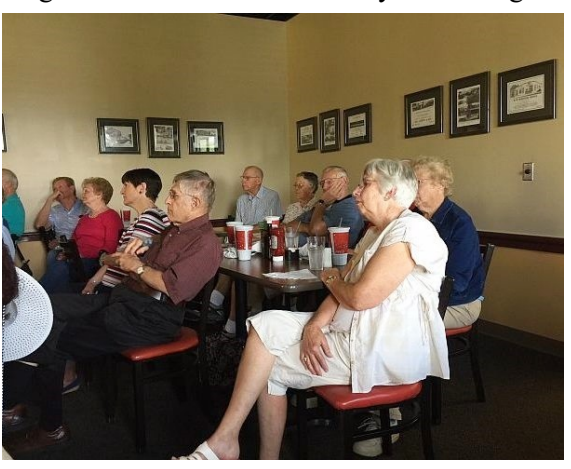
W-S members enjoyed the meal at Golden Corral in Waynesboro as well as our guest speaker.