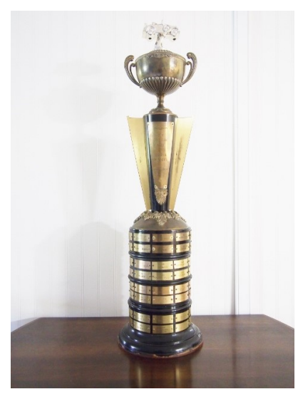
The "Walser & Edgar Rohr Trophy" is awarded to the region with the largest percentage of members participating in the meet, regardless of region size.

Waynesboro-Staunton Region won this trophy in 2000, 2006, 2007, 2014, and 2018