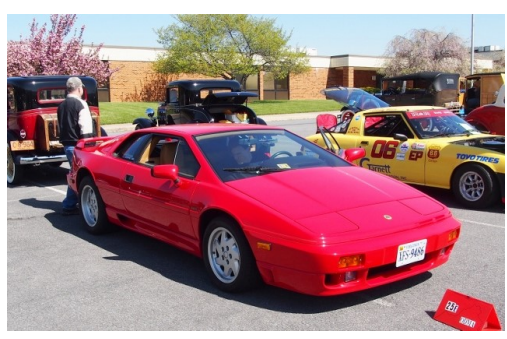
1990 Lotus Esprit—Steve Cummins