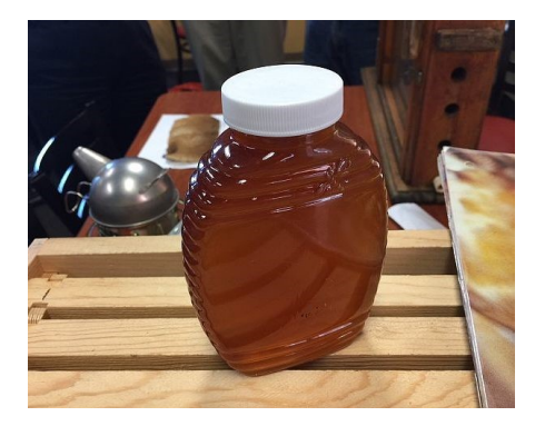
The finished product - locally grown.