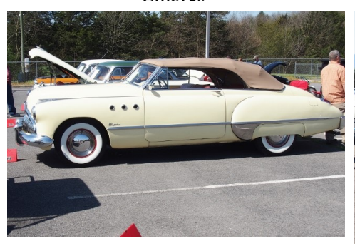
1949 Buick—Jim Gregory