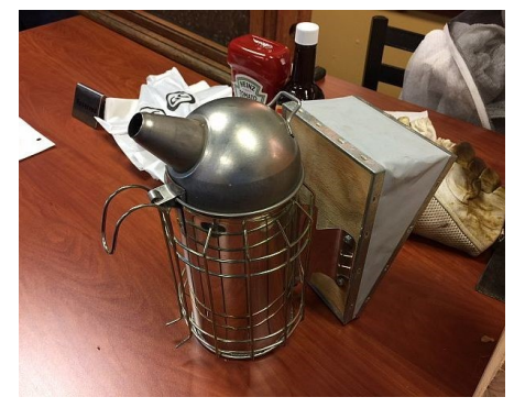
The smoker used to calm the bees when working on a hive.