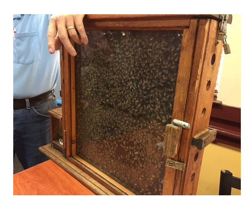
The demo. hive close up.