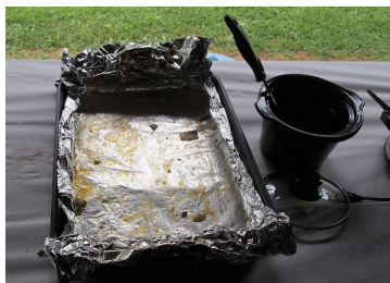
The end of a perfect picnic!