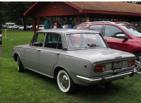
Wamplers' 1968 Toyota Corona