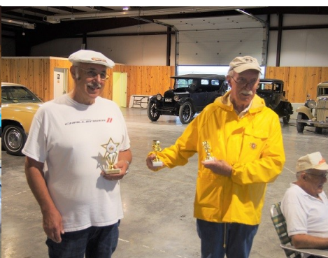
Peoples' Choice winners display their awards. (The Stones had departed for home prior to this photo.)