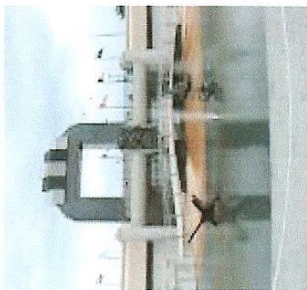
National D-Day Memorial, Bedford