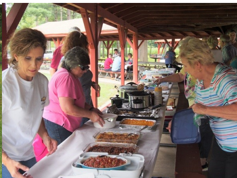
The ladies uncover all the delicious food as we prepare to dive in.