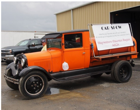
Nelson Driver's 1930 Ford AA Oil Tanker welcomed visitors to our display.

Our Region held its annual car display on Friday of Fair week. We had one of the few dry sites on the fair-grounds. The weather ranged from sprinkles to total gully washers that turned the grounds to a muddy mess. Attendance at our display was limited to a few souls seeking a dry refuge from the rain. In spite of the weather we managed to get 20 cars on display and members seemed to enjoy the chance to get together. Officials cancelled Fair activities at about 5:45 PM and the rain let up so we could pack up and head for home.