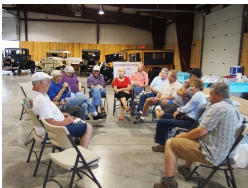
Our August Board Meeting was held as we waited for the rain to subside.