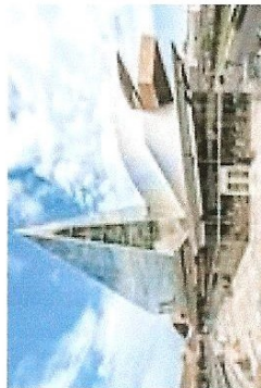
Taubman Museum, Roanoke