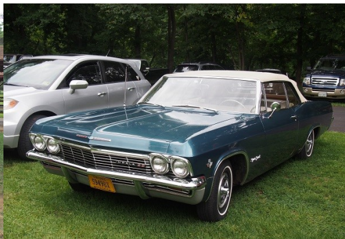
1965 Chevrolet Impala SS from Tri-County