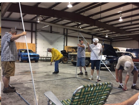
Our main display banner (designed and built by Alfred Meyer) being disassembled by the crew as we prepare to depart.