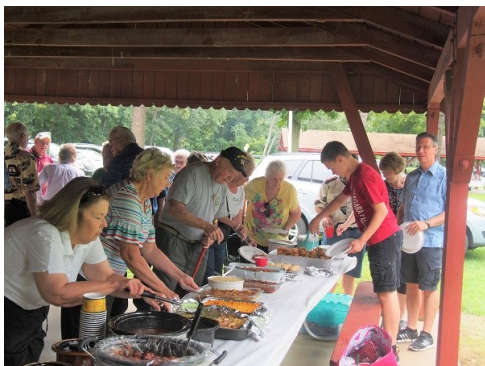
Good food and fellowship—That's what AACA members enjoy!