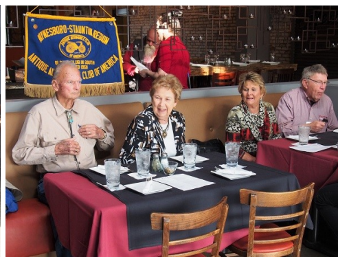
The Stones and Bradfields looking forward to their orders.