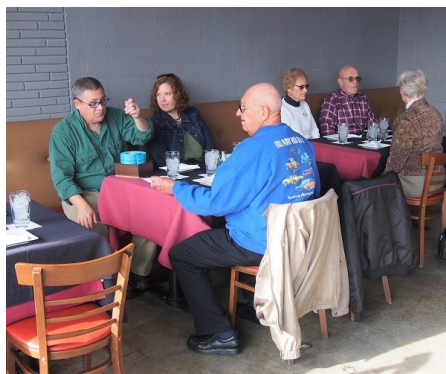
The Gregorys getting ready for lunch.