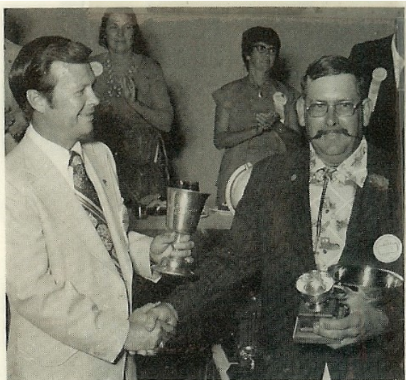
Glidden Tour—Sept. 1977— Georgia