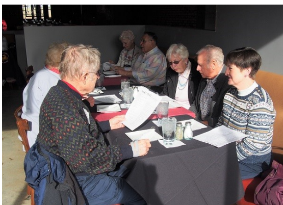
The Owens and Linkes check out the menu.