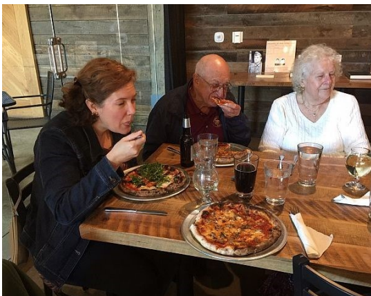
The Gregory family diving into some wood-fired pizza.