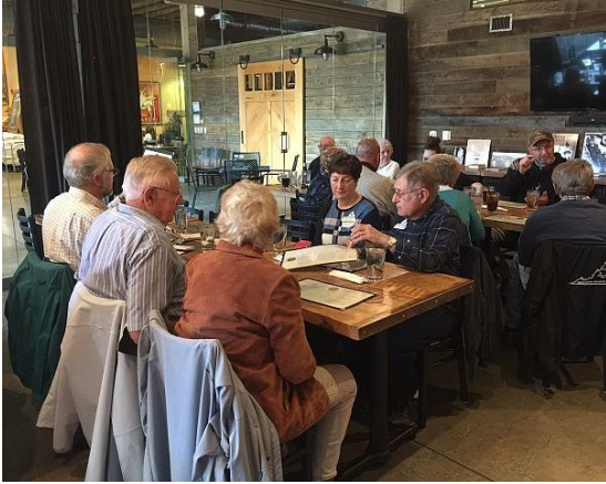
W-S members perusing the menu at Bella Luna.