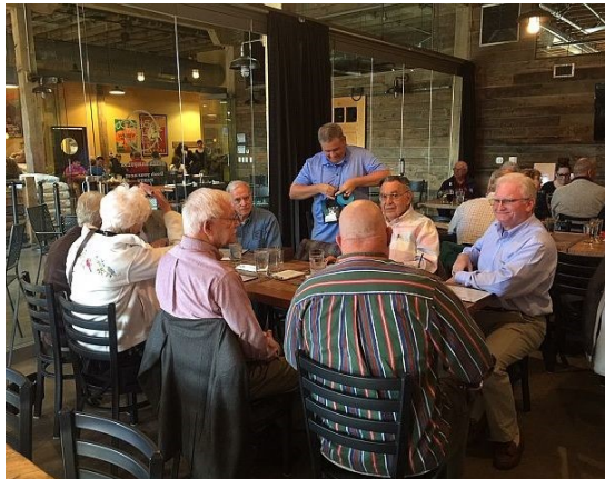
It's just not a W-S club meeting unless you buy your 50/50 tickets!