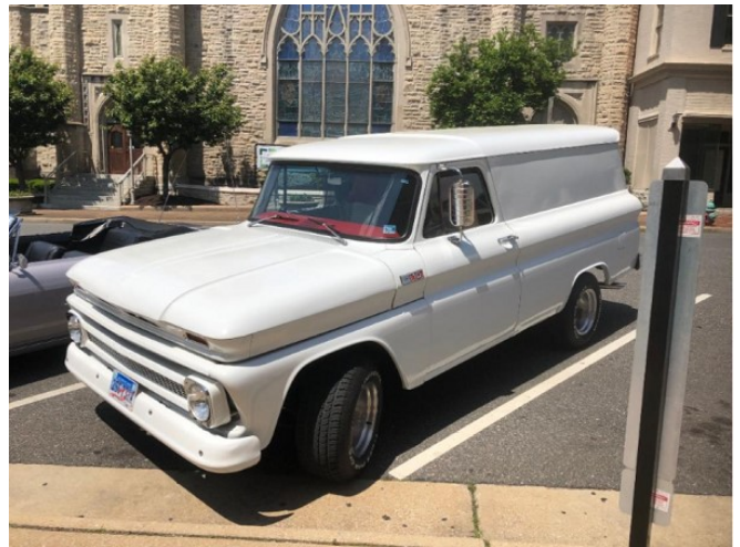
Allison Graves brought her latest purchase—a 1965 Chevrolet C10 Panel Truck.