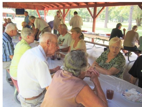
Members catch up on the summer events.