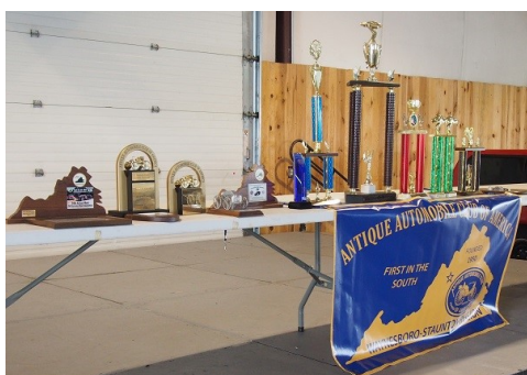
The awards display on stage.