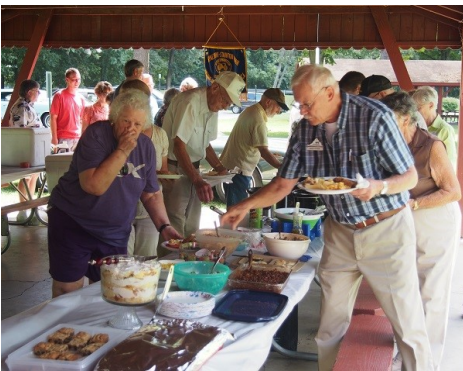
Members work through the buffet line. So much to choose and too small plates!