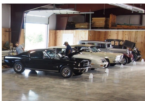
Some of the 24 Members' cars on display.