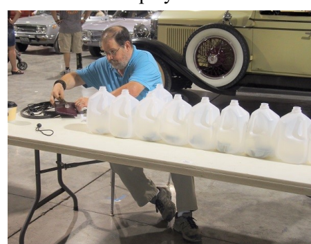
Fair official counts the donations.