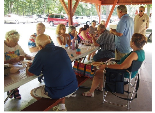
Is there room for dessert?