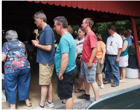
These guys look anxious—not to worry, There's always plenty of food.