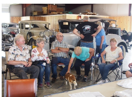
Members enjoy the chance to socialize.