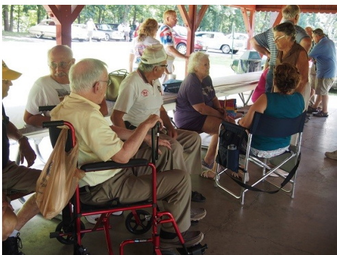
Food and fellowship—who could ask for more?