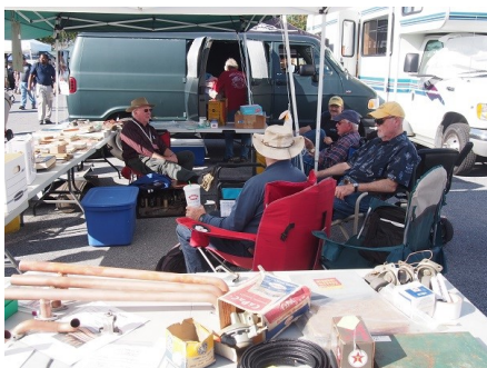
Swapping stories in the swap meet.