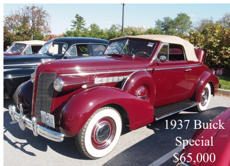
1937 Buick Special $65,000