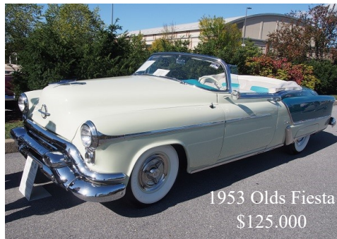
1953 Olds Fiesta $125,000