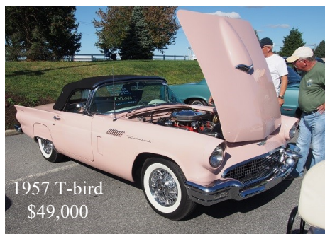
1957 T-bird $49,000