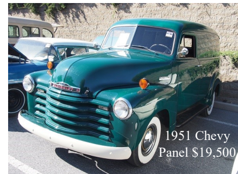
1951 Chevy Panel $19,500