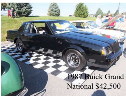
1987 Buick Grand National $42,500