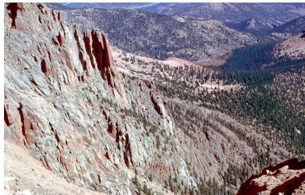
Photo op. looking over the edge of the road.