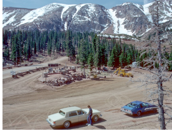
Test cars at a typical scenic tourist stop.