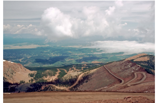
A view at the roadway below. 19 1/2 miles with 162 turns.