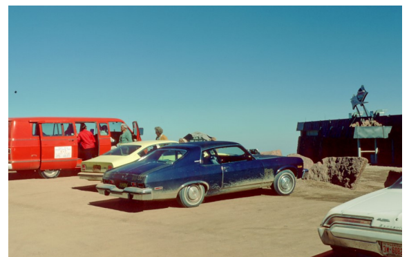
Top of the Peak—Summit House.