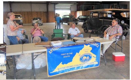
Guests were welcomed by members who answered questions and gave out some applications