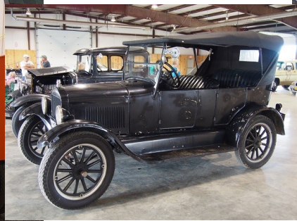
Nelson's 1927 Ford T-Model had just returned from a tour in Ohio.