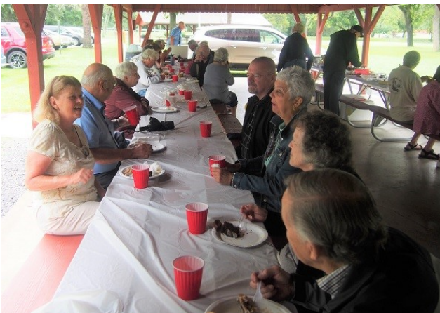
Nobody goes home hungry after an AACA picnic