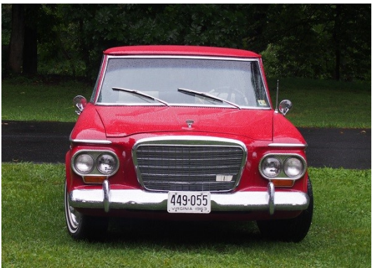
A Tri-County member's 1963 Studebaker Lark braved the showers.