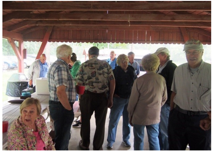
Turnout was good in spite of the wet weather.