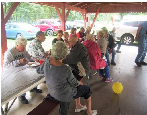
There was plenty of time to socialize as we enjoyed the delicious desserts