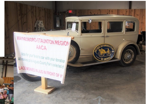
Visitors and members voted for their favorite car by depositing money in milk jugs in front of each car.