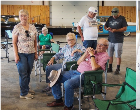
There was plenty of time for members to catch up on the summer's activities.