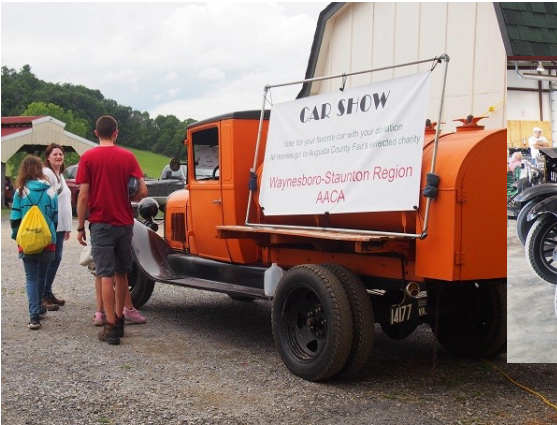
Nelson Driver's 1930 Ford AA Oil Truck welcomed fair goers to our display.