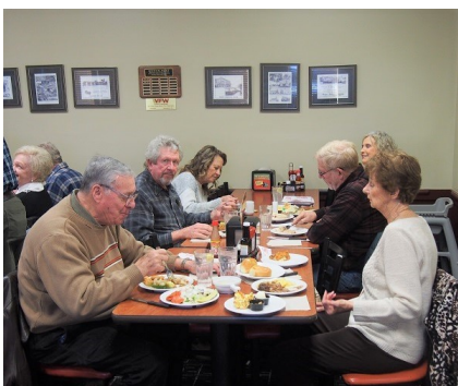
You don't leave hungry from the Golden Corral.