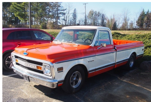
Nobody knew the owner of this 71/72 Chevy Pickup. Neat ride!