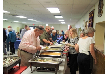
We had 3 cakes to finish up a great catered meal.

The major event in May was the celebration of our Region's 70 th Anniversary that was delayed 2 years due to Covid.