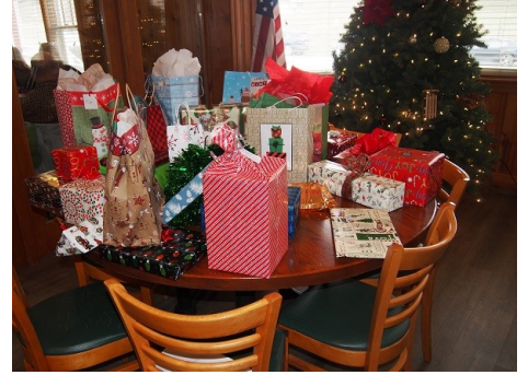
Treasures await the gift exchange.