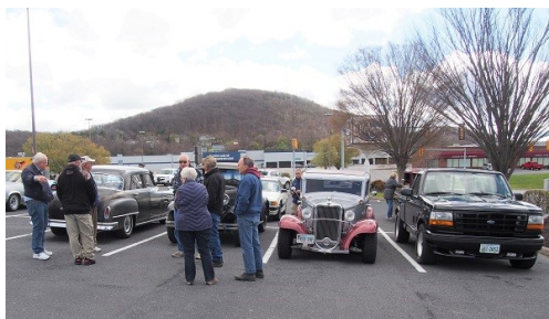
On a crisp April morning we met at Staples in Staunton.

One stop was Old Providence Stone Church built in 1793.