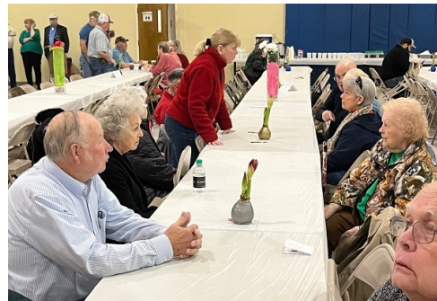
Our gang had time to socialize while waiting for the buffet.