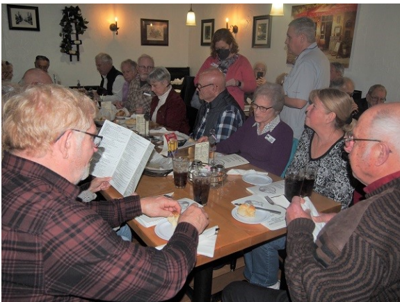
Enjoying the rolls while studying the menu.