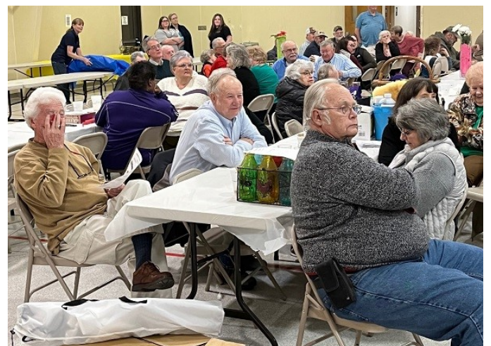
It's tough to stay awake for the live auction after all the food and the silent auction excitement.