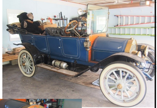
1913 Overland Touring