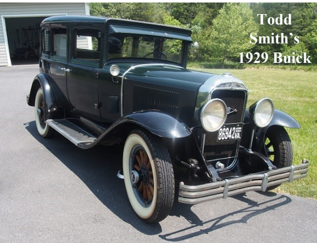
Todd Smith's 1929 Buick