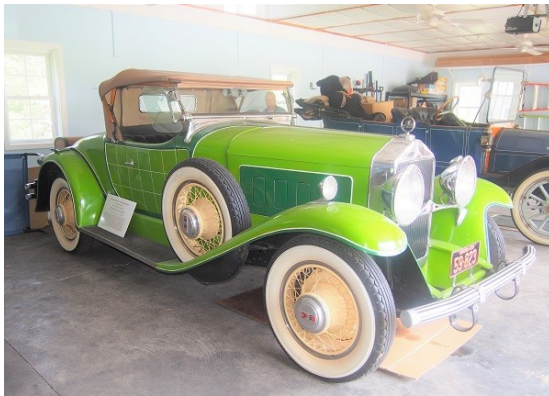
1930 Willys-Knight Plaidside