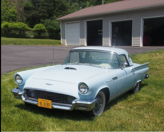
1957 Ford Thunderbird