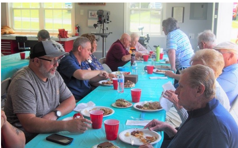
There is always plenty of food at an AACA potluck picnic!