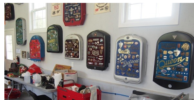
Good News: Their radiator badge collection was in another building and survived untouched.