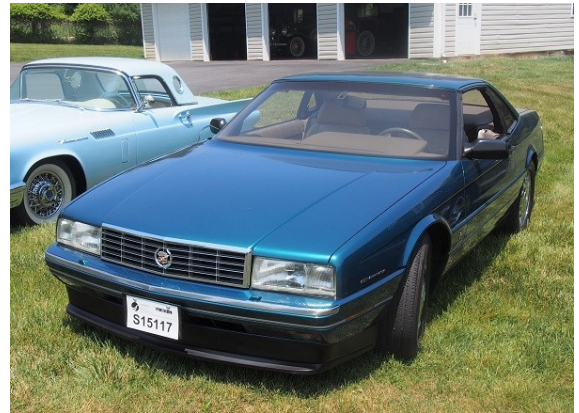
The beautiful "Replacement" 1993 Cadillac Allante recently purchased online by Rebecca