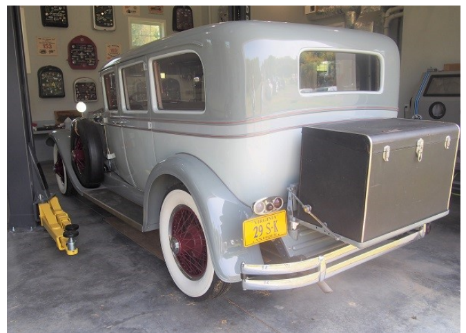
This is the replacement 1929 Stearns-Knight purchased to replace the one lost in the fire.