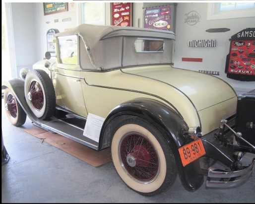
1929 Stearns Knight Cabriolet