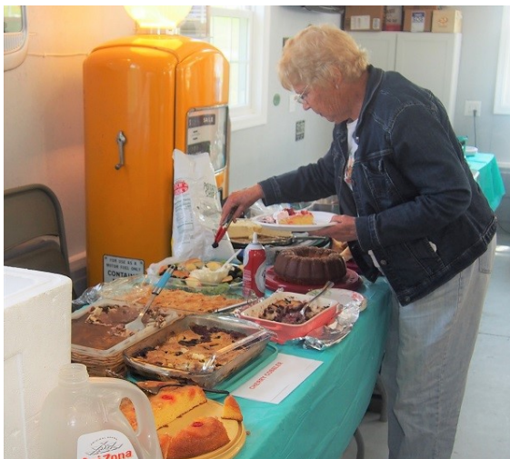
Did I mention we had 12 deserts?