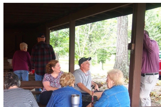
It's a great time for fellowship while the steaks are on the grill!