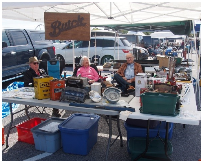
Free seats and advice at our spots.