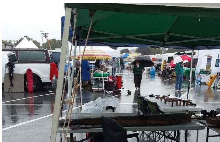
It has rained at Hershey on occasion.