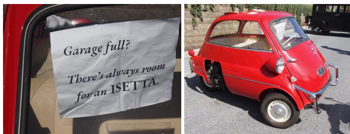
Car Corral Feature