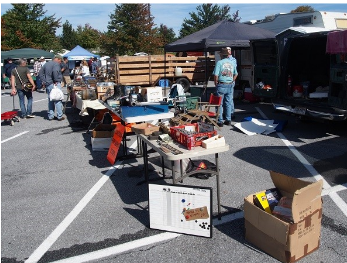
You never know what treasures await at Hershey.