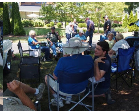
Our members enjoyed the shade.