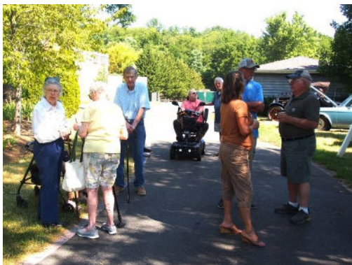
Residents were out in force to see our vehicles.