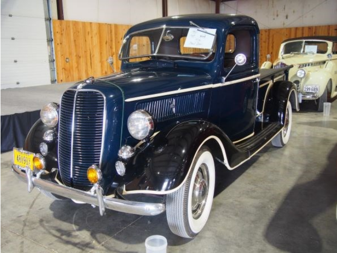
Paul Day & Polly Belford brought their 1937 Ford Pickup.