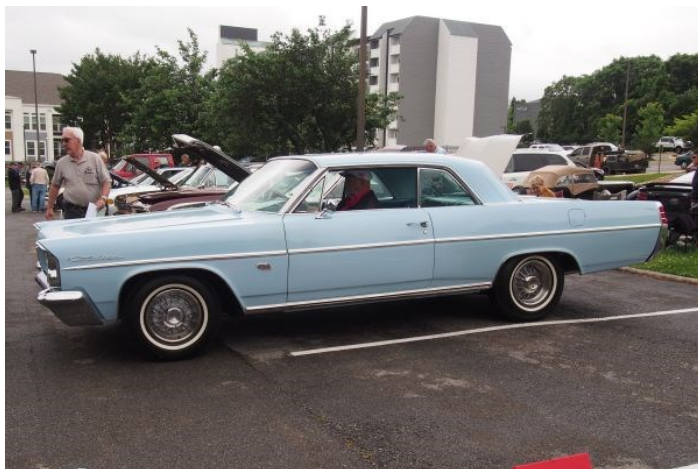
1963 Pontiac 421 in 3 —Tommy Nolen