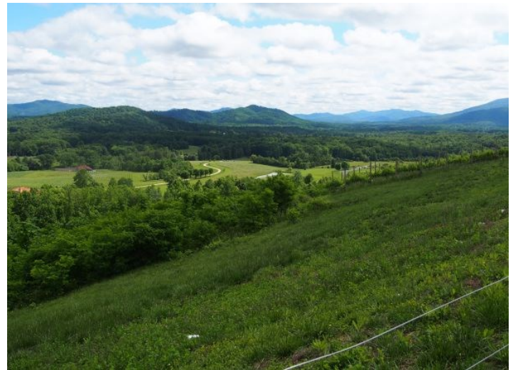
Scenery like this reminds us of why we love the Shenandoah Valley!