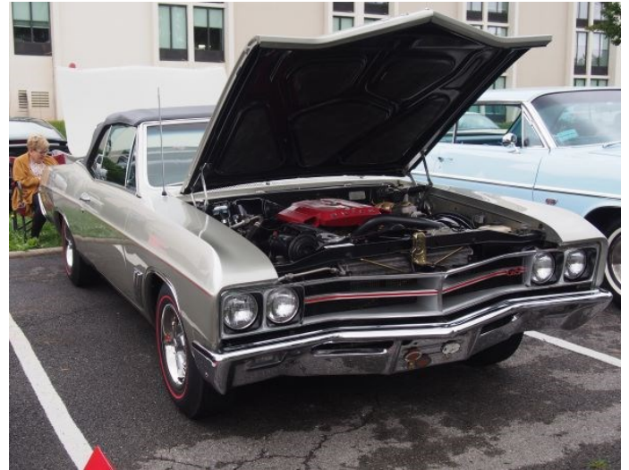
1966 Buick GS