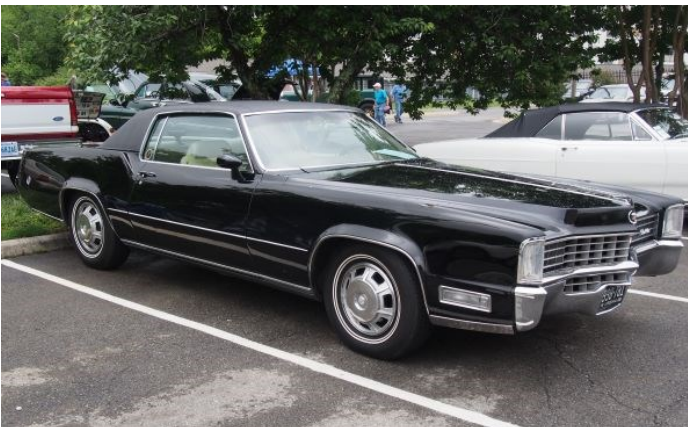
1970 Cadillac Eldorado