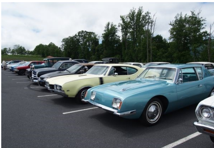
Nice turnout of member's and guest's vehicles.