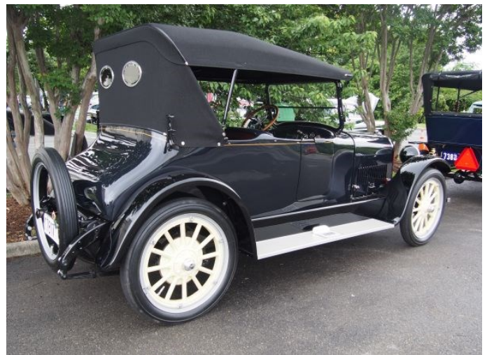
Best of Show —1916 Nash—Reggie Nash