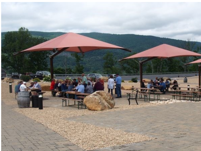
Sundrellas offered shade on a beautiful day.