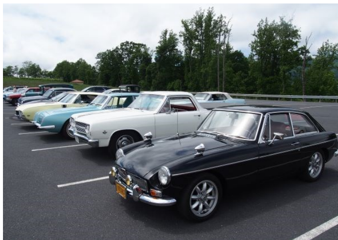
Proof that a 1967 MGB GT can conquer the mountain!