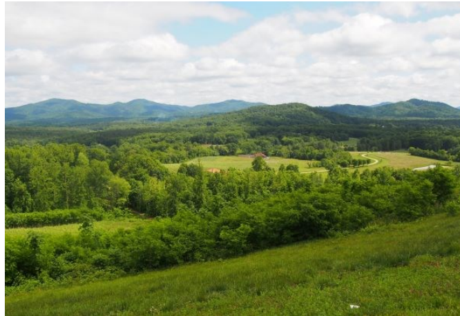
Great views from the patio.