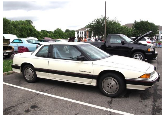
1989 Buick Regal GS (HPOF) - Stu Allen