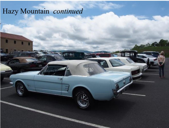
Butch Beverly bought another Mustang to use as a sample to help reassemble his old one.