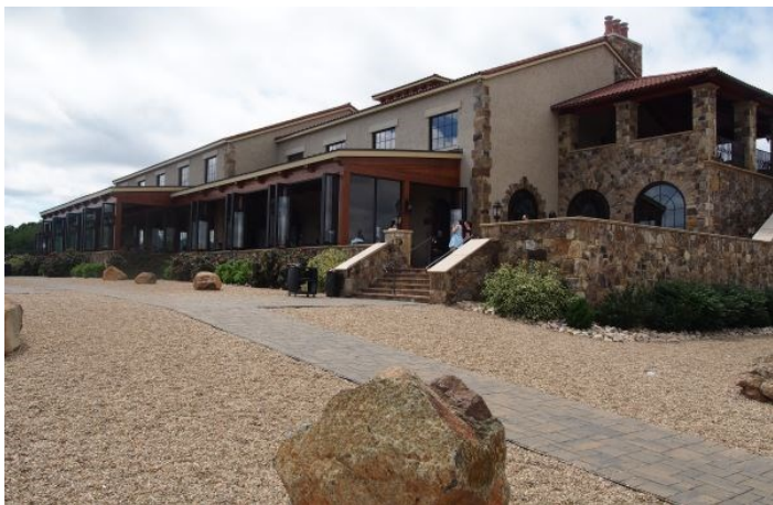
The Hazy Mountain facility is impressive.