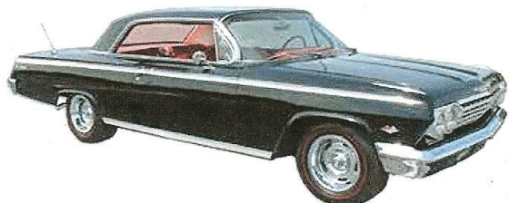
2012 Best of Show 1962 Chevy Impala SS Cody Rexrode, Crimora, VA