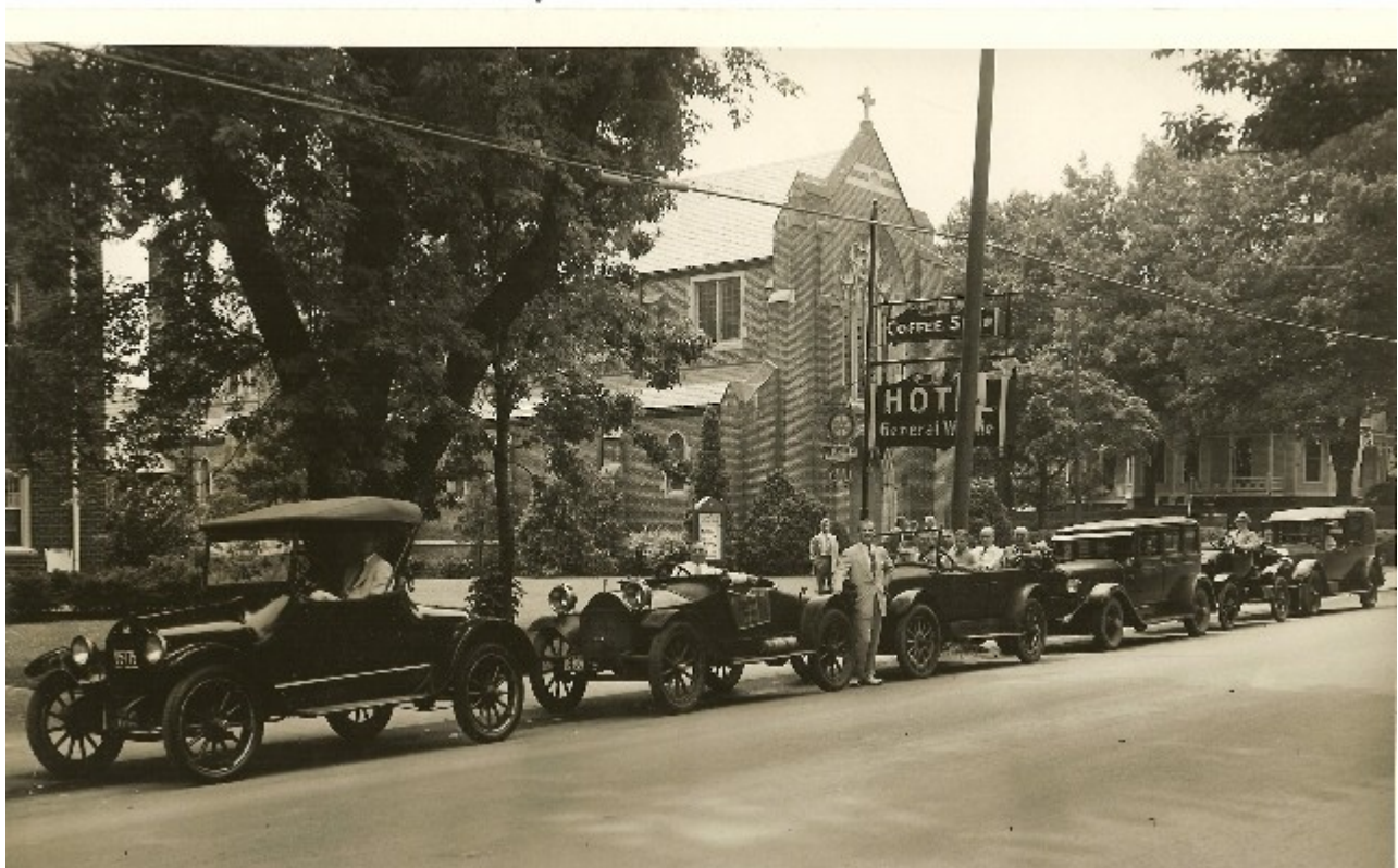
Some of our Founder's cars parked in front of the General Wayne Hotel, Waynesboro, April 18, 1950

NEXT MEETING : Sunday, April 21, 2:00 PM, W-S Region Meeting . Pano's 3190 South Main St. Harrisonburg — Founders Day Program