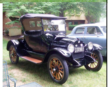
Participants' Choice 1917 Buick Roadster Stu Allen