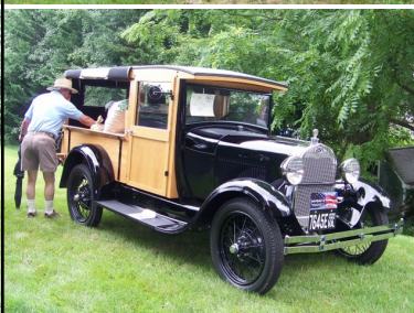
Residents' Choice 1929 Model A Huckster Robbie Gray