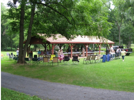
Scenes from 2014 Annual Picnic

16 Sunday, 1:30 PM, Annual Picnic Meeting with Tri-County Region AACA at Grand Caverns Park in Grottoes. Fried chicken, plates, utensils, ice & drinks provided. Bring a dish to share and your lawn chair.