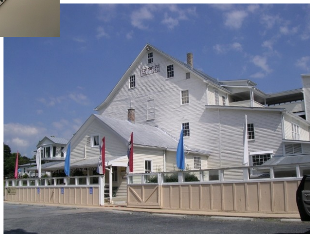
The Mill has three floors packed with exhibits.