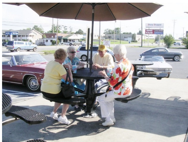
Ice cream at Kline's was a refreshing break on a beautiful warm day.