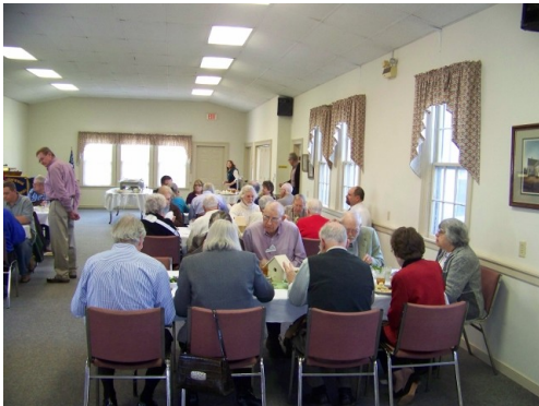
Tinkling Spring Presbyterian Church Fellowship Hall provided a great venue for our January program