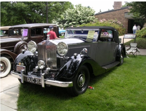
Dick McIninch showed his 1936 Rolls-Royce Phantom III.

The show field was mostly on grass with shade trees making it very comfortable.