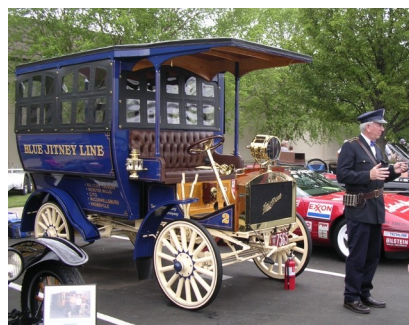
With so many great cars on the field it was tough to decide which to take pictures of. Here is a 1912 Little Giant D Bus that won a 1 st Grand National Award.