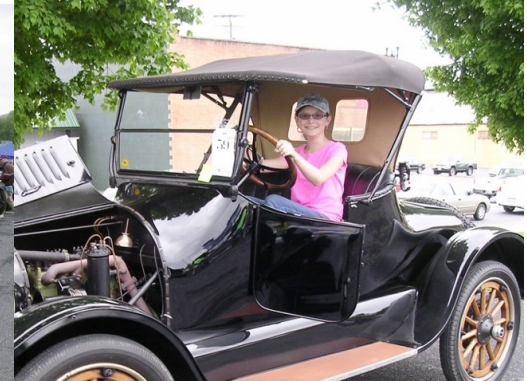
Getting young people involved