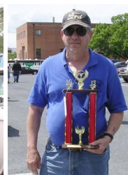
"Best of Show—Trucks"