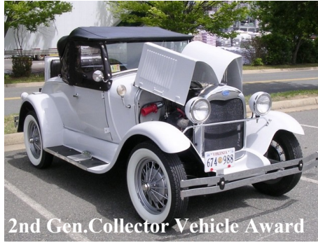
2nd Gen. Collector Vehicle Award