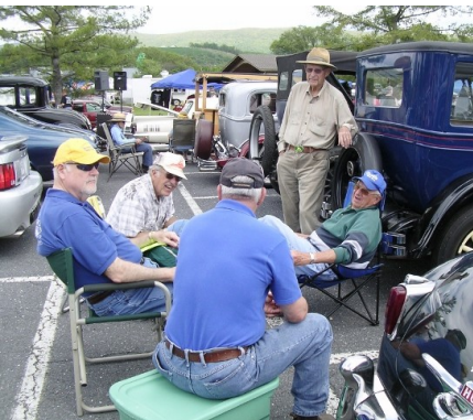
"Oh the stories they told!"