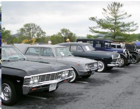
The AACA Row