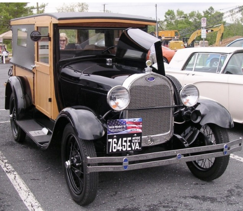
1929 Model A Huckster—Robbie Gray