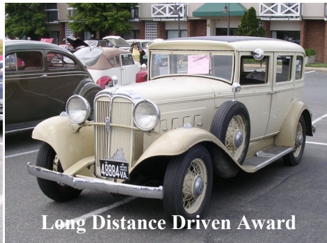
Long Distance Driven Award