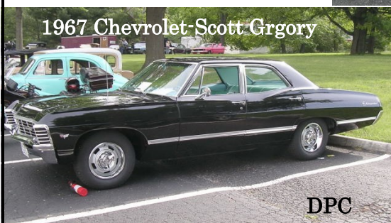
1967 Chevrolet-Scott Grgory