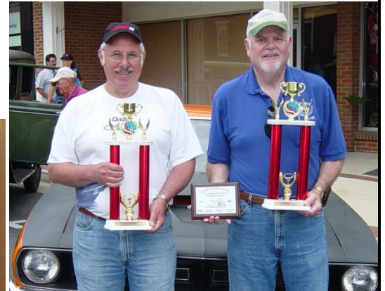
Our President and V.P. with their trophies