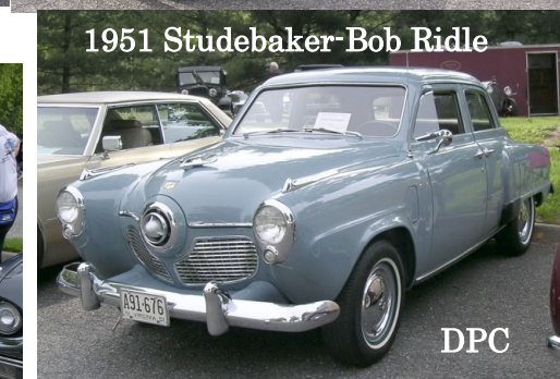
1951 Studebaker-Bob Ridle