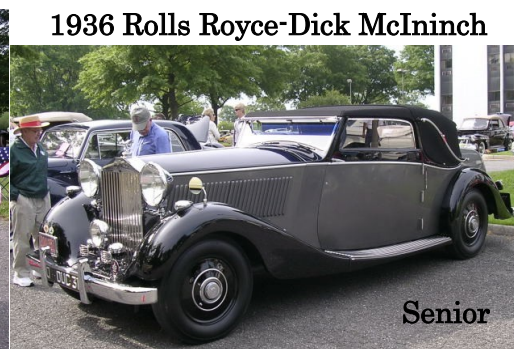
1936 Rolls Royce-Dick McIninch