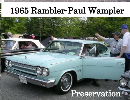
1965 Rambler-Paul Wampler