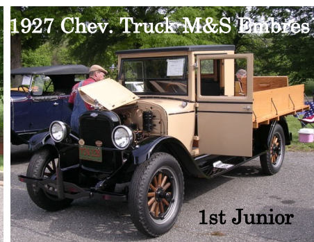
1927 Chev. Truck-M&S Dambres