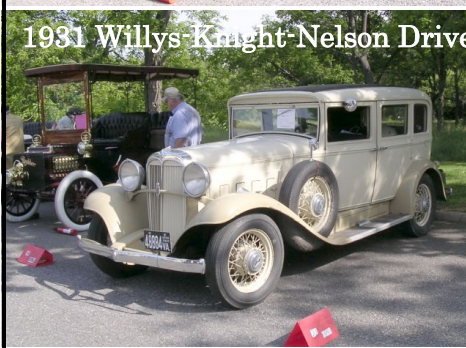
1931 Willys-Knight-Nelson Drive