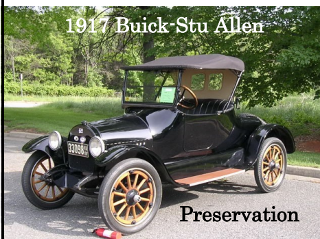
1917 Buick-Stu Allen