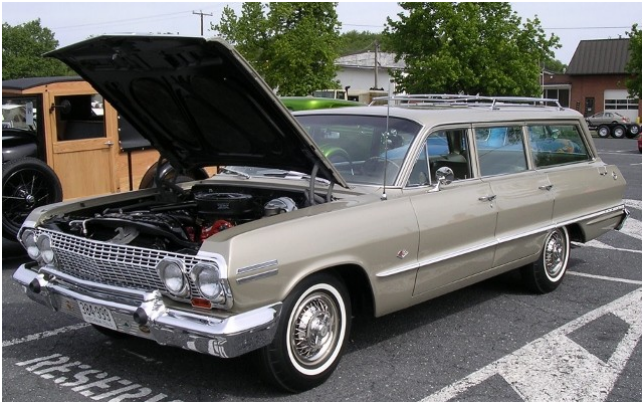
1963 Chevrolet Impala Wagon—Ken Farley