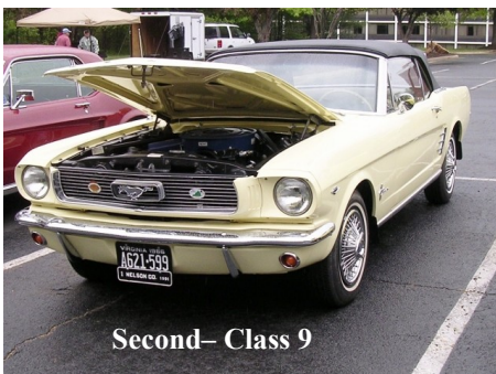
Second- Class 9