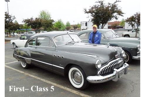
First- Class 5