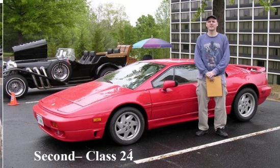
Second- Class 24