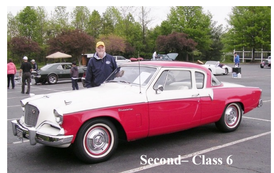
Second- Class 6