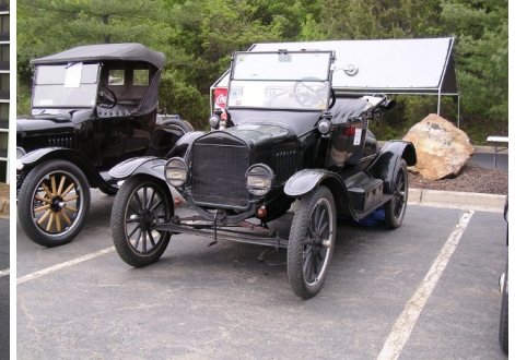
Billy Melton's '23 Model T