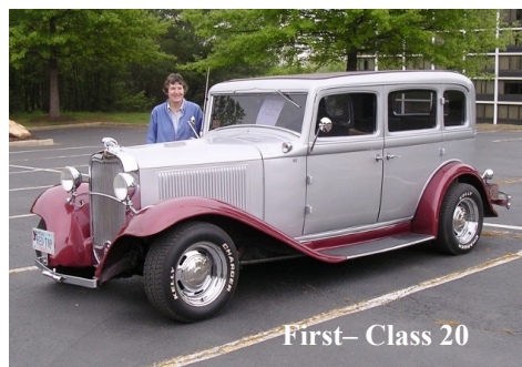
First- Class 20