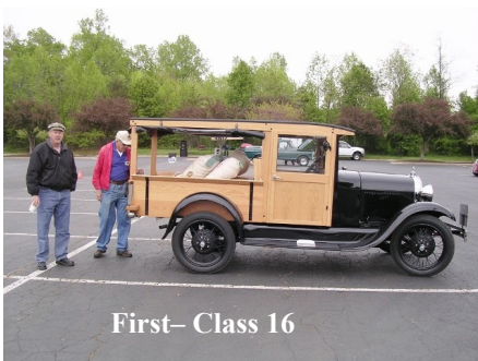
First- Class 16