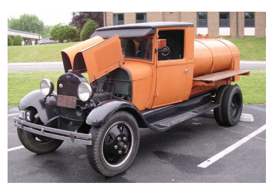
Scenes from 2013 WWRC Foundation Show