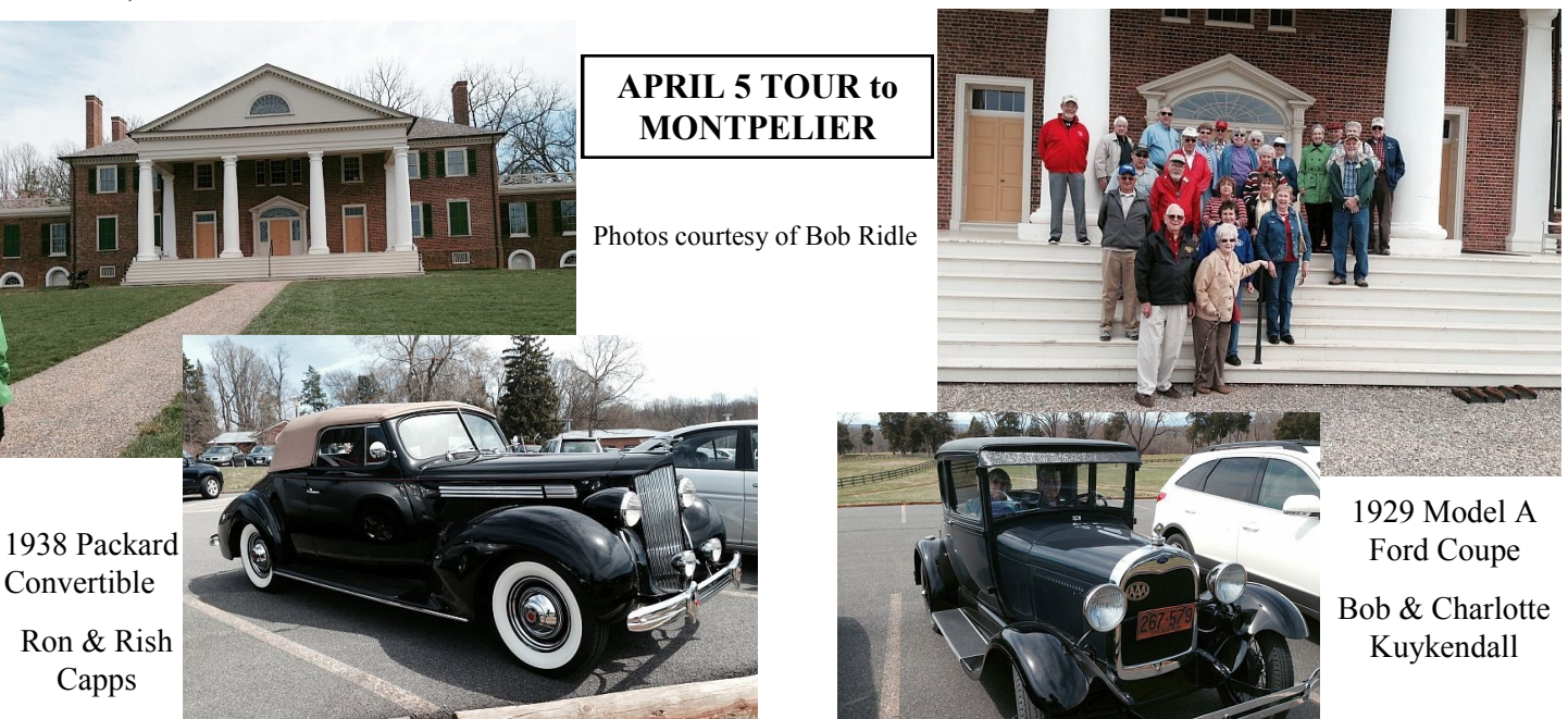
Volume 44, issue 5