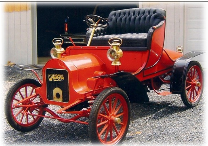
The Wayne back in Virginia (2006) after repurchase by the Brown Family after restoration in California