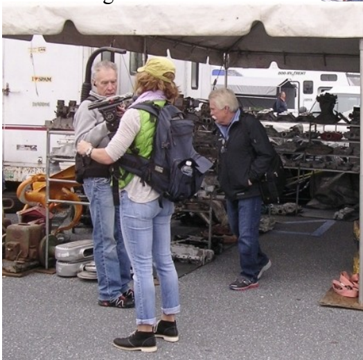
“Chasing Classic Cars” star Wayne Carini was in the swap meet with his camera crew.