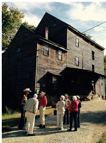
The group gathers at Woodson's Mill