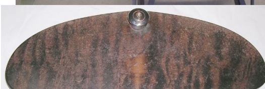
Glove box door before and after new wood grain