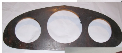
Gauge panel before and after