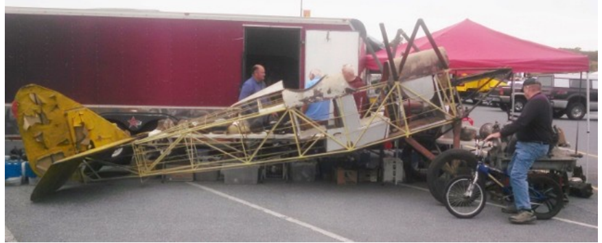
“Restorable—Ran When Parked”

There is always something different at Hershey