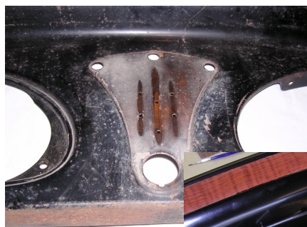
Center section of dash before and after