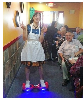
Thai Staunton staff member on her 2-wheel electric scooter