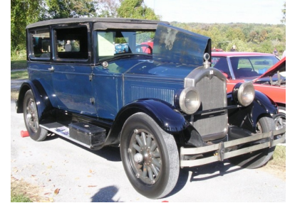
Some beautiful show cars