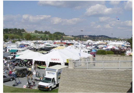
Chocolate Field North viewed from the bridge