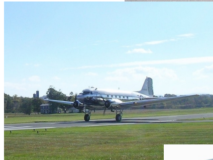
Dynamic Aviation flew their beautifully restored DC-3 giving guests rides all day. Proceeds went to local charities

Veterans were honored for their service to our country