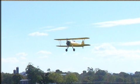
Rides were also given on a vintage Stearman biplane