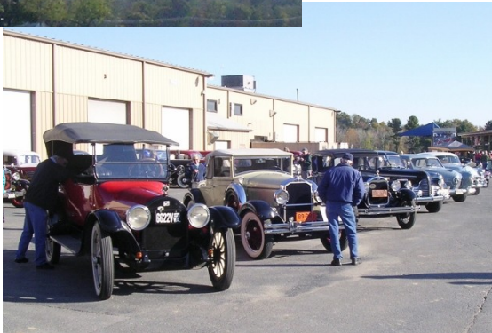
Members enjoyed the sunshine and cool fall temperatures