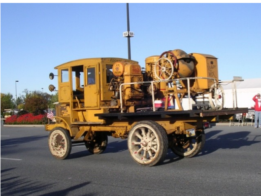
An early International cement truck enters the show field