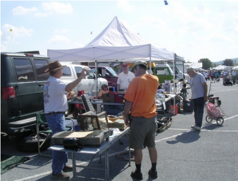
Shoppers enjoyed great weather!