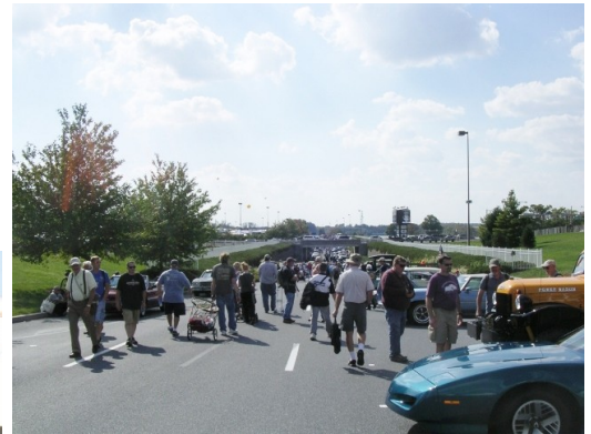
The car corral was busy as usual.