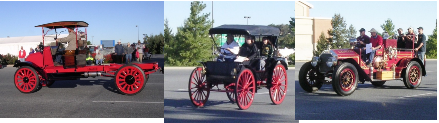
Saturday Morning—Watching the incoming vehicles as they head for the show field