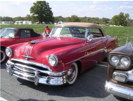
1954 Pontiac Star Chief convertible $69,000