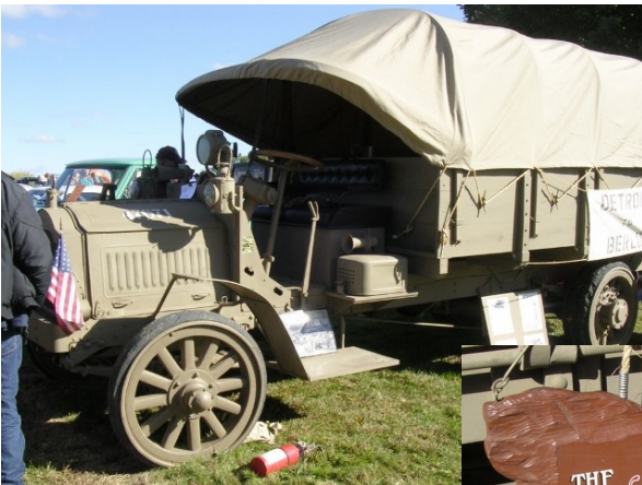
A WW1 era U.S Army Packard Truck