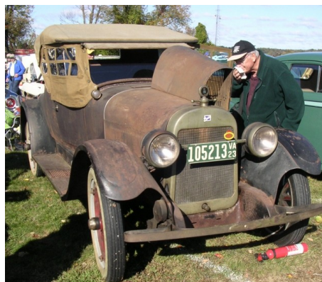
A 1923 Buick in HPOF class