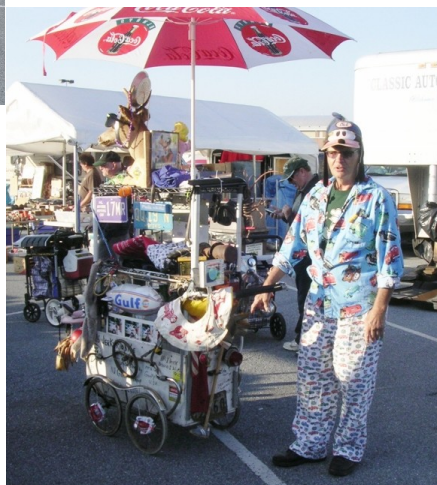
Hershey is a great place to watch the entertaining people