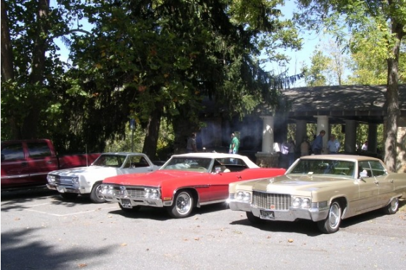
The gang gathers with the smell of steaks on the grill