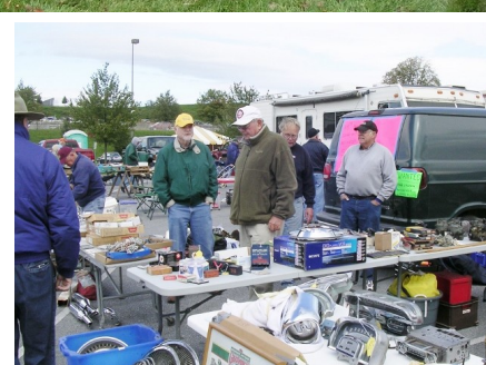
Sales and the weather were brisk in 2012