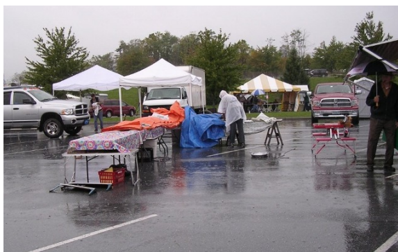
A "little rain" in 2013