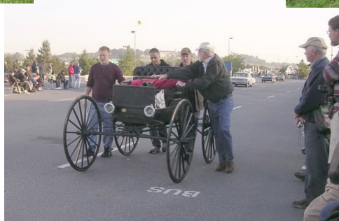
This high wheeler needed a push in 2011