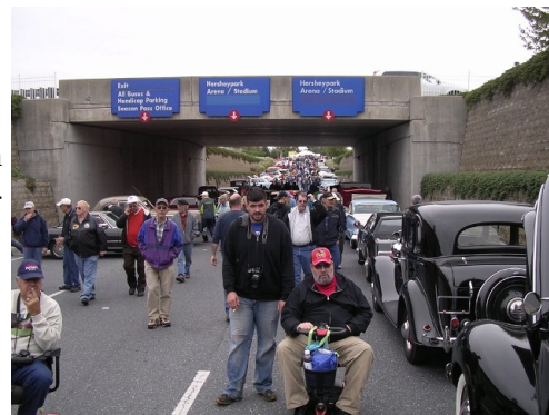
Car corral in 2014