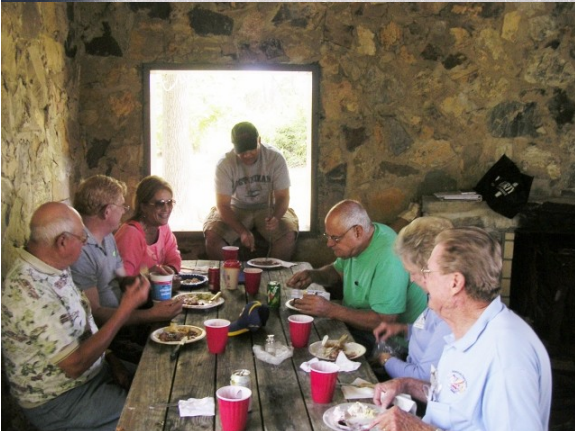
Everyone enjoyed the wide selection of food.

A big hit was the homemade peach ice cream courtesy of Mel & Marilou Redmond