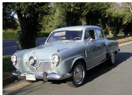
Bob's Bullethead on the 2011 Fall Foliage Run.