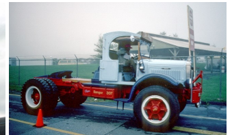
Big trucks are always a hit at Hershey