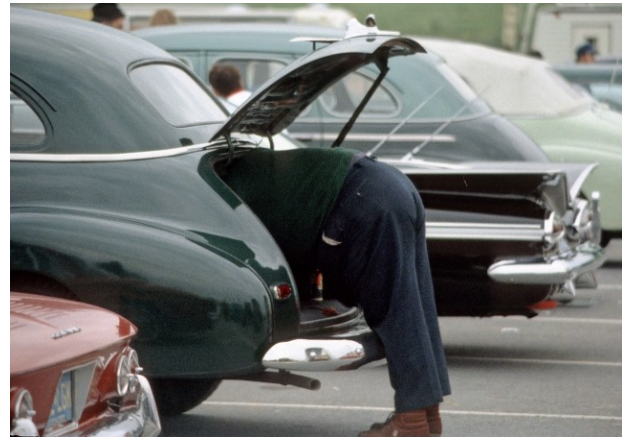
This Chevrolet looks as if it will swallow the owner.