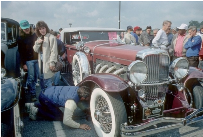
This photographer is serious about details of this 1930 Duesenberg. Note the warm coats.