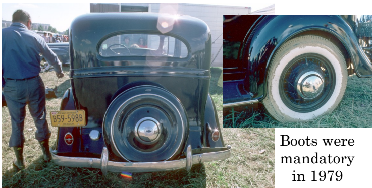
Boots were mandatory in 1979