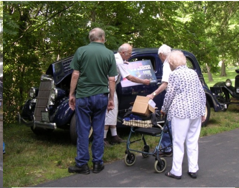
The staff at the facility tell us that residents look forward to this every year