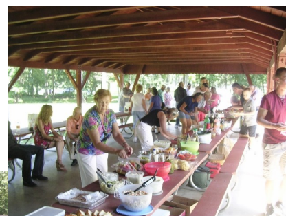
Scenes from 2015

Our Annual Picnic with Tri-County Region is August 14. See you there!